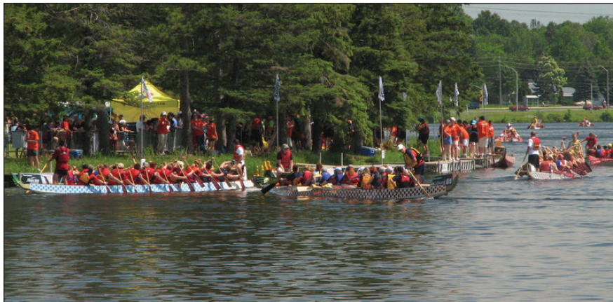
Teams preparing for the 2006 races.