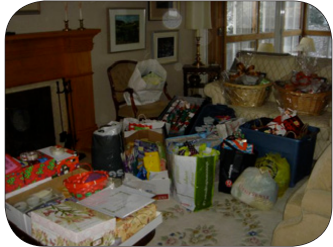
Getting ready for the 2013 Holiday Party...

As you can see, everything was under control in Santa's Workshop. By Nov. 23, 2013, door prizes, raffle items, and grab bags merrily took over Alice Bolt's living room.