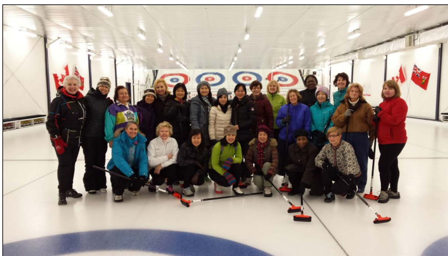
Diplomatic Hospitality Group at the Navy Curling Club