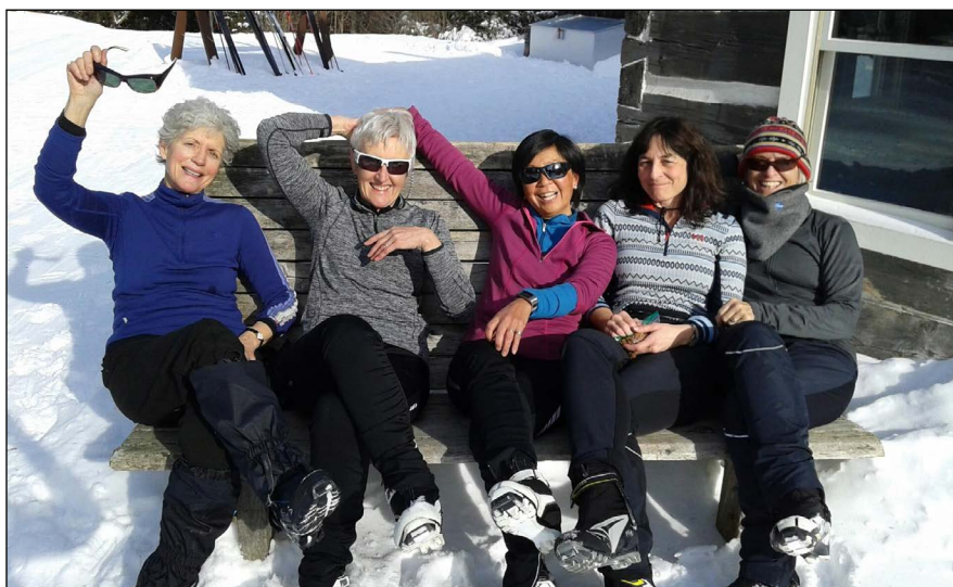
January 22, the Gatineau Trails cross-country ski group skied to a cabin near Meech Lake. They bravely started out in the parking lot at minus 25 degrees but were soon stripping off layers.