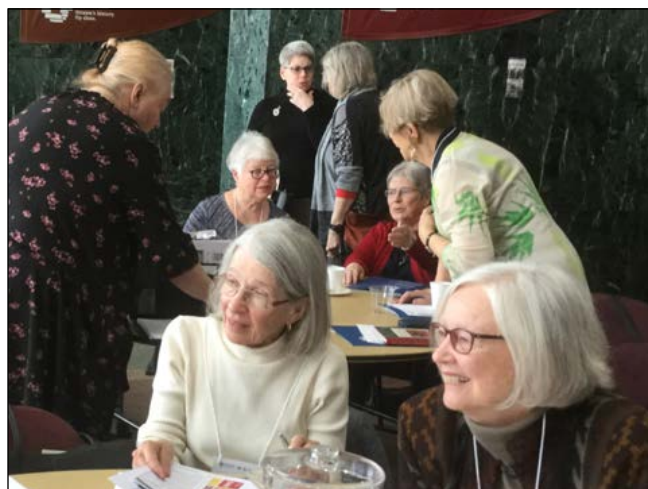
Discussion at the seminar.