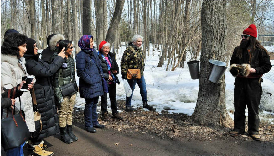
Maple syrup tour.

On the evening of Tuesday March 19th the Diplomatic Hospitality Group (DHG) hosted a “Spring and Summer Style” fashion show, private shopping party and reception at Shepherd’s Fashions in the Trainyards Plaza,