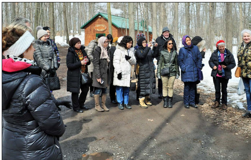
Members and guests of the Diplomatic Hospitality Group at Vanier Museoparc. See page 6 for more pictures from the Diplomatic Hospitality Group.

World Religions Study and Interest Group Convenors of the Month Opera Performance Muslims in Canada An Exciting Occasion Diplomatic Hospitality UN Commission on Status of Women Did You Know...? Request for Silent Auction Items Dinner for Hope and Silent Auction A Raffle for GWI The KAIROS Blanket Exercise Mental Health in Afghanistan Bridge and Mahjong Membership Renewal Speaker Series – Help Requested Preparing for National AGM 2020 New Interest Groups Next Season