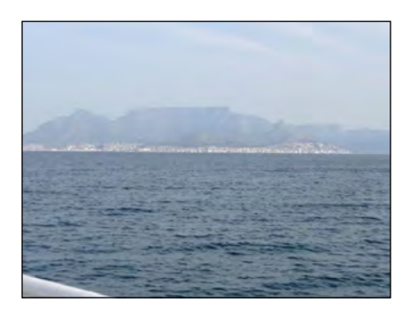
Cape Town from Robben Island.

Being a CFUW delegate to the 32<sup>nd</sup> Triennial General Assembly and Conference of Graduate Women International (GWI) in South Africa this summer was an enlightening and uplifting experience as well as an opportunity to visit a fascinating and beautiful continent.