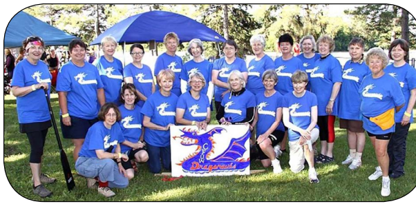
The Dragonauts