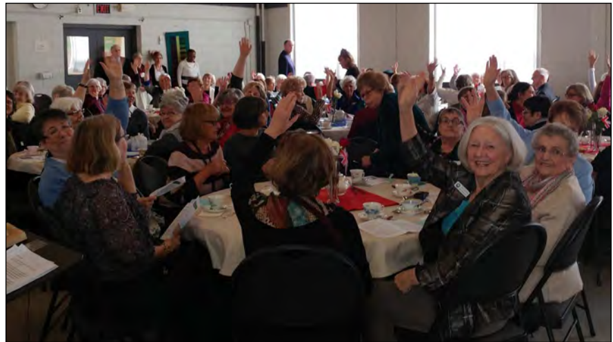
Happy Guests prepare to enjoy the show.