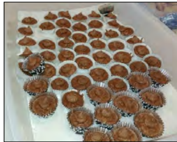
Top left: Lynne Bond baked 257 delicious brownies.