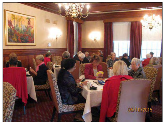
Members and guests playing duplicate bridge in the dining room after lunch