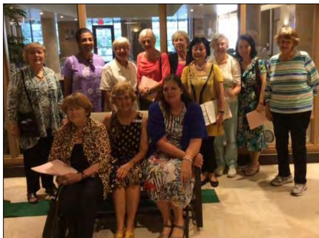
The group visit to The Ravines on Sept. 17

Convenor, Exploring Retirement Communities Study and Interest Group