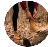
Fun & Fitness